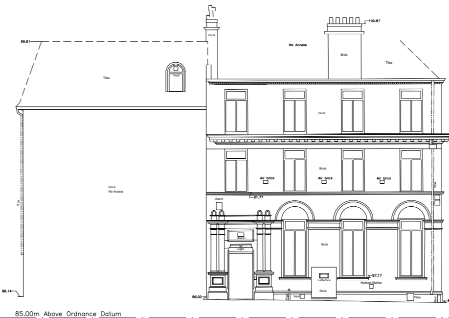
Existing elevation 4