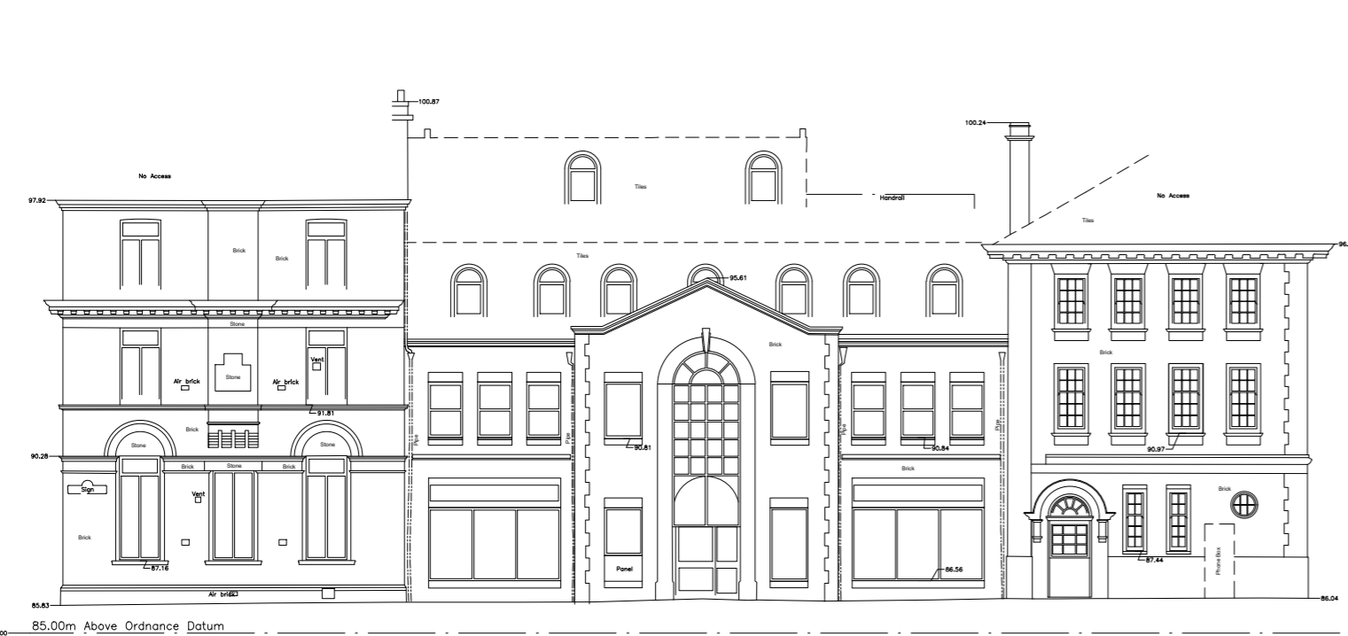
Existing elevation 1