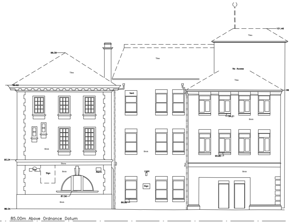
Existing elevation 2