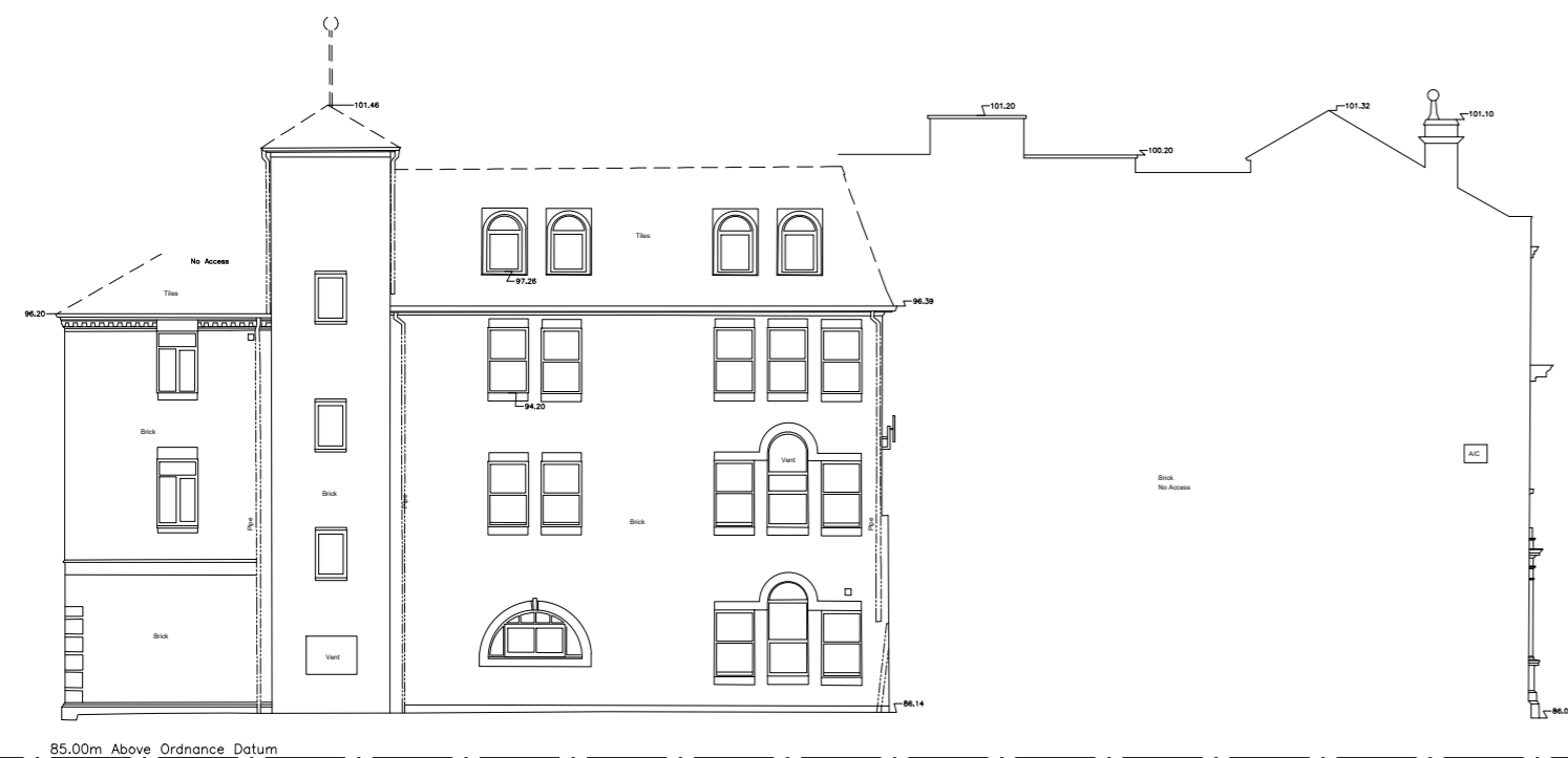
Existing elevation 3